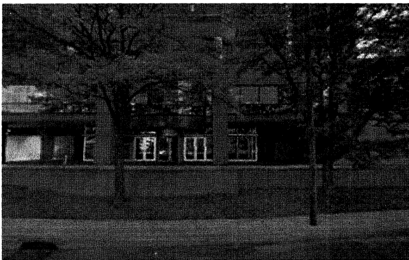
400 Kelby St Fort Lee, NJ 07024